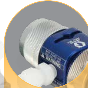
Lock ring and cap

Simple thread adjustment with locking ring