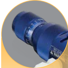
Ultra precision knob

Micrometer telescoping knob for precision fluid adjustment with numerical indexing for retainable adjustment settings